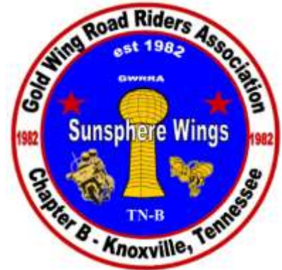
Assistant Chapter Directors

Well hopefully we are through the last cold snap and on to warmer weather, sure has seemed like it the last couple of days anyway. As I am writing this we are just days away from heading to Spring fling and I can't tell you how much we are looking forward to it. District rallies can be a lot of fun to go too but like anything you have to put some effort into it and work toward getting the most out of it, in fact that is the same with any chapter function as well, you just can't wait on the fun to come to you, you have to work on making it happen. A few ways to get the most out of chapter life is to participate, show up to all the meetings that you are able too, make some of the scheduled rides in fact even suggest some and if you are not comfortable leading one then I am sure we can always find someone to lead it for you. With a chapter it is a whole group of people that enjoy the same interest and enjoy spending time together, it's not groups inside a group but the whole group that makes it work. In every chapter it is people willing to help others and thinking of others when we make our plans so that we all get the benefits and we all get the most that chapter life can offer and the same goes for district events as well and you know the old saying and it still holds true today, the more the merrier because we all like to eat, socialize and above all ride. Hope to see you all at our meeting.