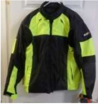
Bilt Spirit H2O jacket, lady's size large, brand new, MSRP $299.99, asking $50.