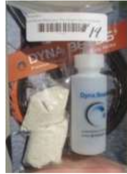
Dyna Beads for tire balancing, new, (with TPMS system in our bike, we can't use these), asking $10