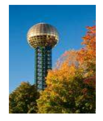
Volume 37: Number 12