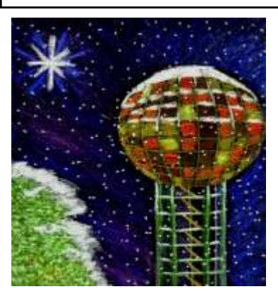
Chapter B Web Site www.tn-b.org