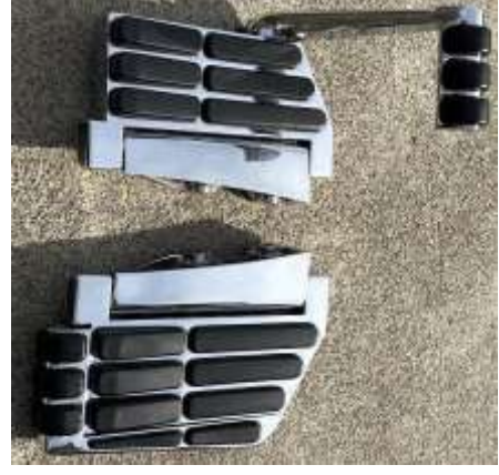
Kuryakyn Transformer floorboards Fit all GL1500 and GL1800 to 2017 - Complete with all rubber inserts - $150.00 pair