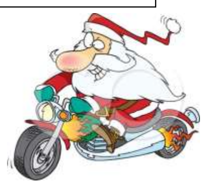
Volume 38: Number 12

Tennessee Chapter B Chartered December 14th 1982 Home of the 1982 Worlds Fair