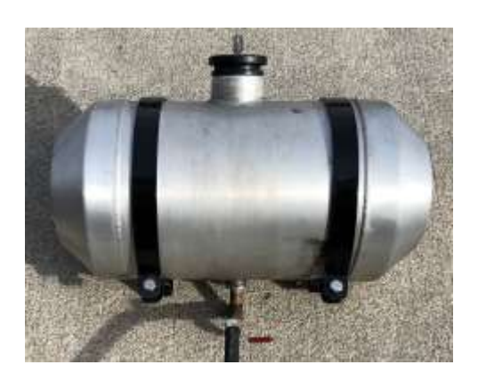
Auxiliary fuel tank. Use for extended riding or maintenance. 3.25 gallon spun aluminum - $100.00