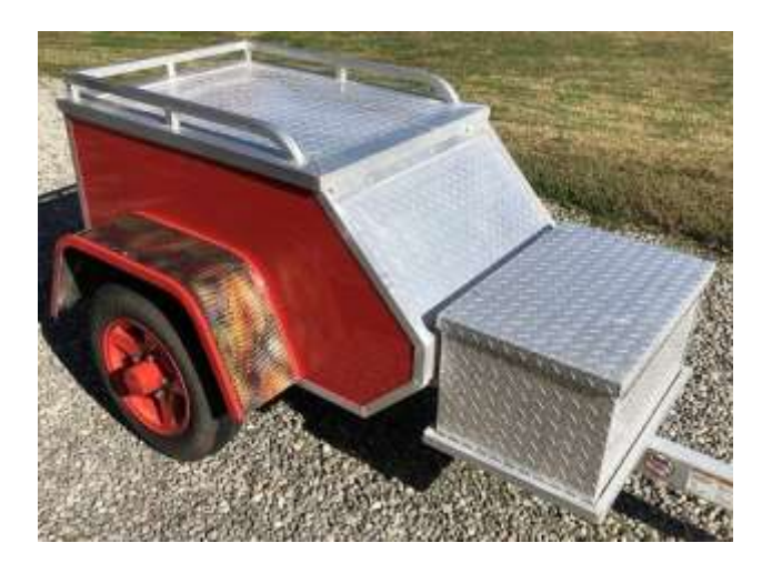
Aluma MCT trailer (3 photos) - LED lights, TN license plate, custom paint with Wing Bling accents - $700/offer

All items contact Mark Kohman 865-3797229 or email him at mkohlnan@stepshirts.com