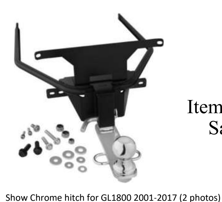
Items For Sale