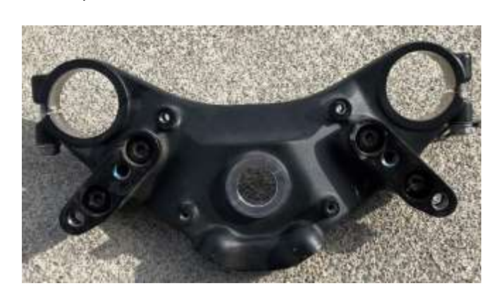
Top bridge for GL1800 complete with handlebar setbacks. Just bolt on - $20.00