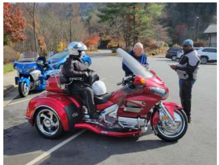
All rested up plugged in and ready to roll