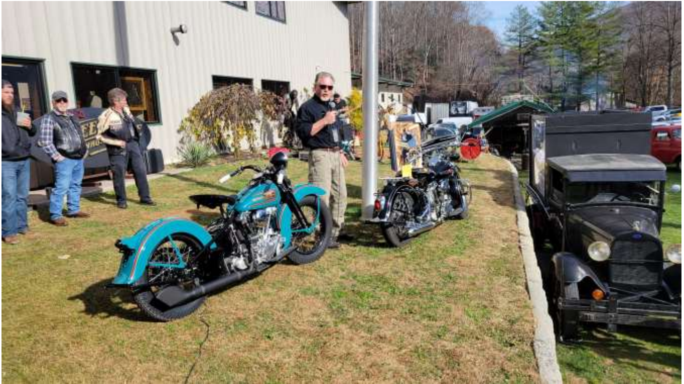
black 1948 Panhead 2021 Grand Prize Blue 1937 Knuckle head to be Grand Prize 2022