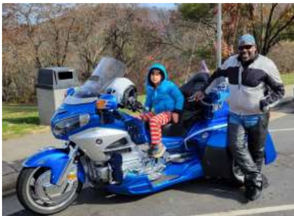
Young girl admiring Johns Trike just had to climb aboard for a photo op at a rest area

They had a pretty big crowd and they couldn't have asked for a more beautiful sunny day. It could have been a little warmer but good cold weather riding gear makes it all better!