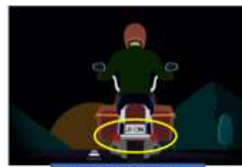
Motorcycle @50 feet ahead