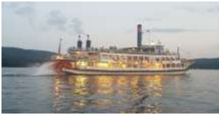
Steamboat on Lake George NY at Americade

Chapter B will be planning to attend this event next year, make your plan to join our group