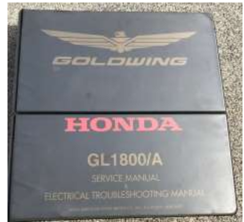
Honda factory Service and ETM manual for GL1800/A 2001-2003 but good up to 2007 $50.00