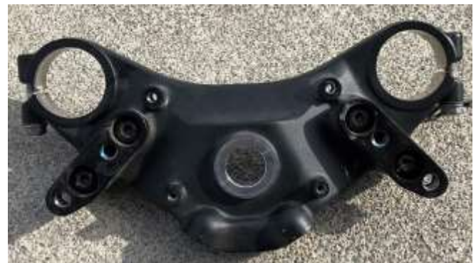
Top bridge for GL1800 complete with handlebar setbacks. Just bolt on - $20.00