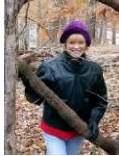
Submitted by: Merrilee