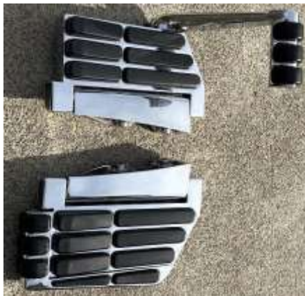
Kuryakyn Transformer floorboards Fit all GL1500 and GL1800 to 2017 - Complete with all rubber inserts - $150.00 pair