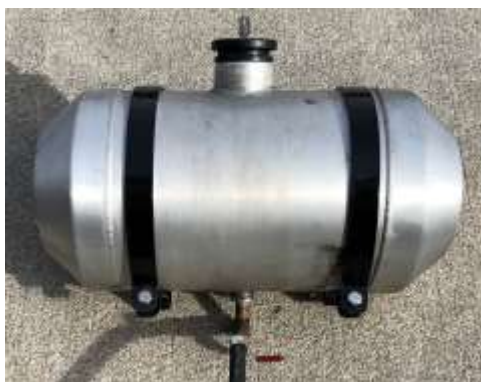
Auxiliary fuel tank. Use for extended riding or maintenance. 3.25 gallon spun aluminum - $100.00