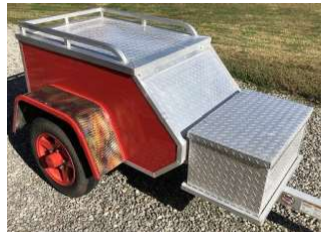
Aluma MCT trailer (3 photos) - LED lights, TN license plate, custom paint with Wing Bling accents - $700/offer

All items contact Mark Kohman 865-3797229 or email him at mkohlman@stepshirts.com