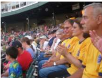
Smokey's Game 8/10