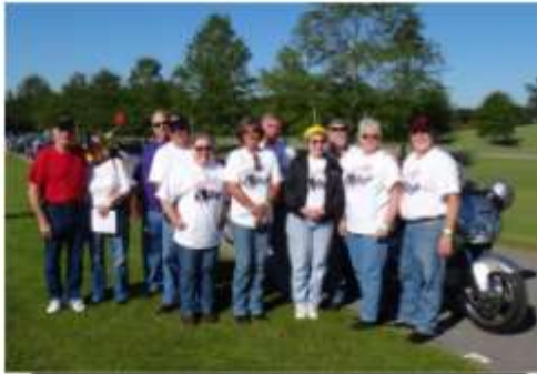
RIDE For Kids Birmingham 2012

I think this month I would like to look back at some of the past Chapter B events.