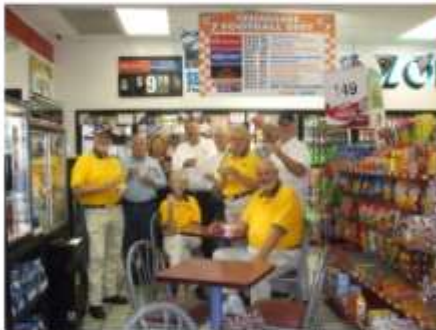
Ice Cream after Chp. Mtg 9/07