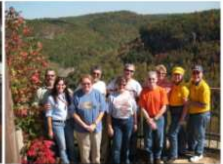
Big South Fork 10/08