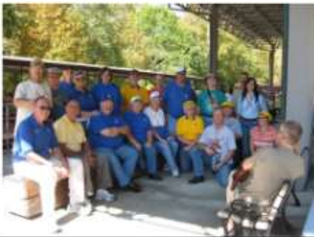
Met Cincinnati Chapter Stearns