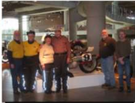
Barber Museum 2008