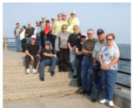
Charleston Ride 5/07

Just a few old pictures of some of the fun things Chapter B folk did in the past lots of good memories. If you have some old photos you would like to share I would love to include them as I do my monthly article.