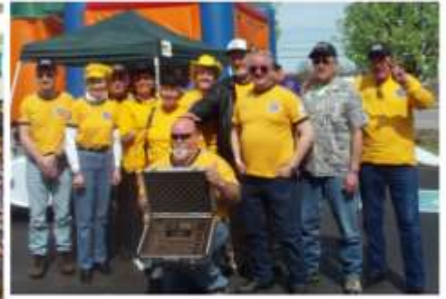
Chapter Plaque Chp Y 3/11