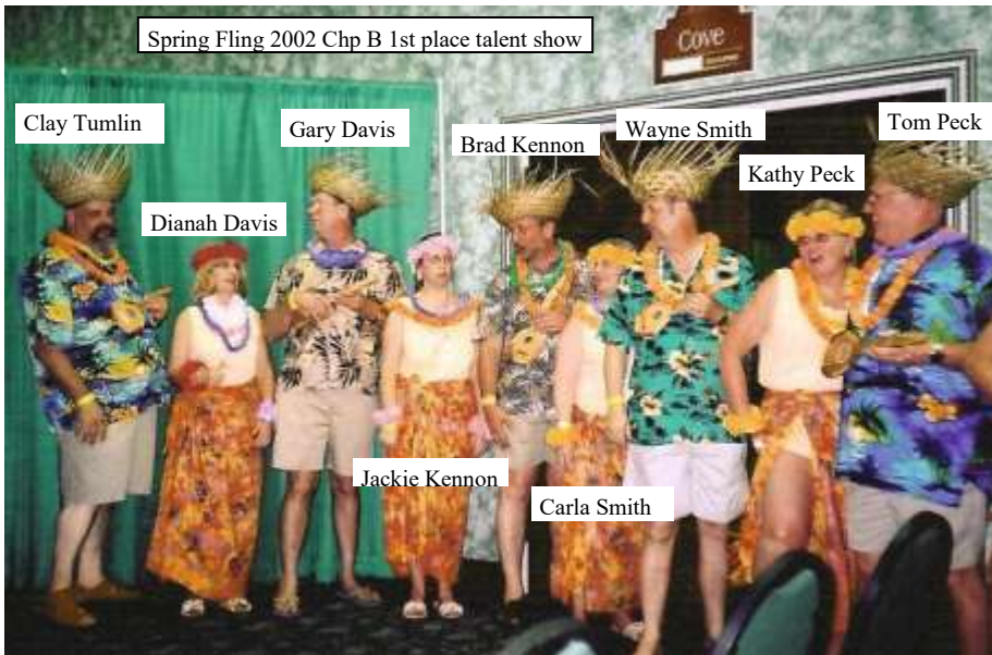
Spring Fling 2002 Chp B 1st place talent show

Each year our couples of the year have some expenses as they travel around representing our Chapter and our Association. Several years ago some came up with a great idea to help out our District couples with some of the expenses they have. Suggestions were for each Chapter to put together a basket of Goodies that would be put on display and raffle tickets would be sold during our annual Spring Fling convention. We will be asking our membership to once again put their thinking caps on and come up with some sort of idea for Chapter B's Basket. Something to do with the Convention Theme " Lets Go Hawaiian " we can discuss what items we need and see if our members would like to contribute to the basket or just make a donation so our committee can go out and buy a few things for the basket. Below are a few baskets from other conventions so you can see some examples.