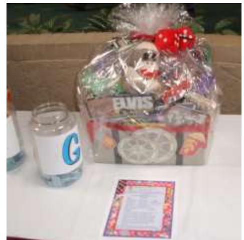
Photo taken of Chapter B during Spring Fling 2002. Chapter B won 1st place in the talent show