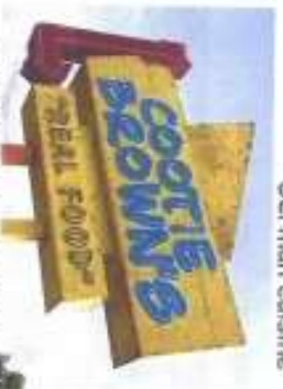
Local "American" cuisine