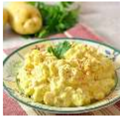
Spring Fling Campgrounds vittles