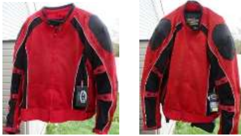
Ladies Jacket Mens Jacket 6 th Gear red mesh summer jackets with zip-out rain liner, very good condition, asking $25 each, $45 for both.