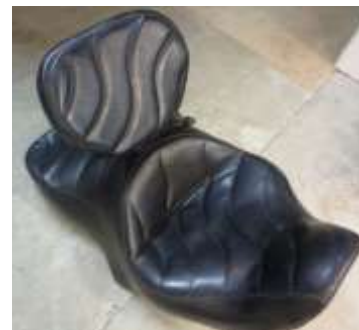
Hartco custom vinyl seat, heated, with rider backrest, matching co-rider backrest cover, rider's backrest storage pouch, new heating element and refreshed rider's seat foam done by Hartco, fits GL1800 2012-2017, original MSRP $1,500, asking $400.00/OBO