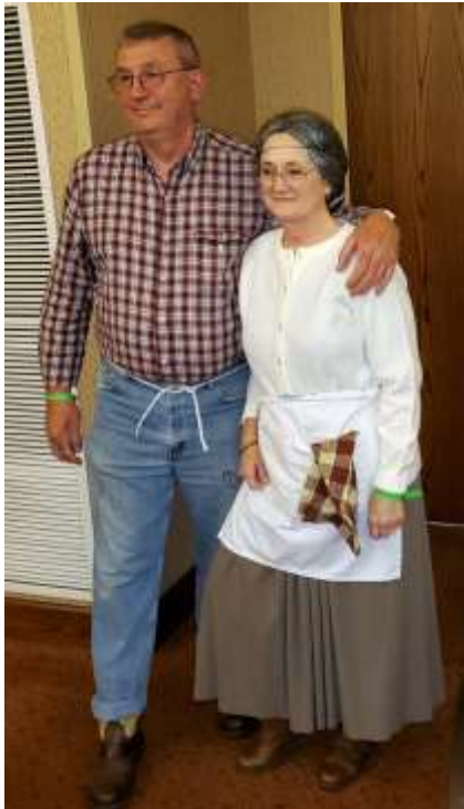
Jethro & Granny you all clean up nice