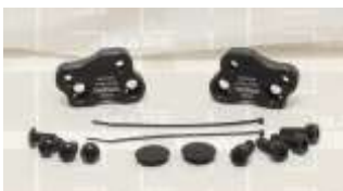
HeliBars Tour Performance handlebar risers for 2018+ Honda GL1800. Very-good condition, only used a short time (replaced with the Helibars Handlebar system), MSRP $129.00, asking $75/OBO