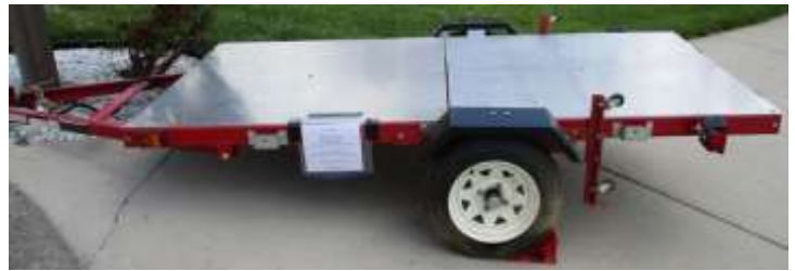
Harbor Freight folding trailer with added aluminum bed, cost new trailer $400.00, aluminum sheet for bed $175.00, asking $250.00/OBO