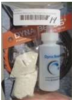
Dyna Beads for tire balancing, new, (with TPMS system in our bike, we can't use these), asking $10