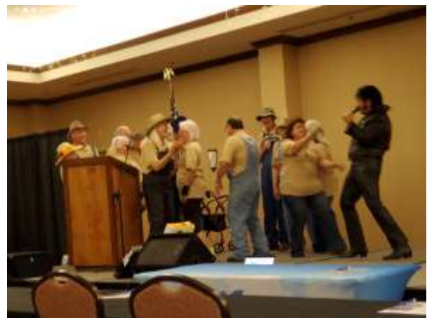
Elvis even made an appearance at this years Spring Fling

worked the Rider's ED. Table and game for a while and did some security work Thursday and Friday and had the honor of being Judges in the Bike Light Show Thursday night. We have never been judges in anything like that before and I was really looking forward to it,