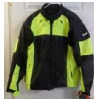
Bilt Spirit H2O jacket, lady's size large, brand new, MSRP $299.99, asking $50.