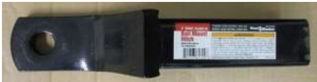
Haul Master Ball Mount Hitch, 2" drop, class III, almost new, MSRP $16, asking $10.