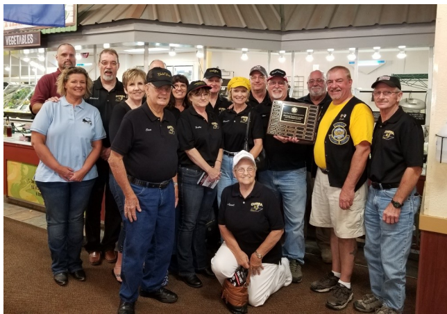
Chapter B capturing the traveling Plaque from Chapter F

These pins and patches are basically souvenirs that are fun to look back on for the memories each represents. When you begin to participate, you too will soon have a host of pins and patches to remind you of the fun times! But, ...wearing a vest is certainly not required. The photo below was taken of our Chapter B family capturing the Traveling Plaque from another Chapter