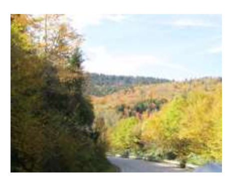
Submitted By: Stanley Rinehart