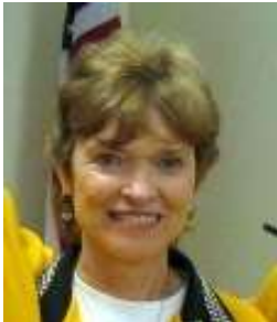
Submitted by: Merrilee