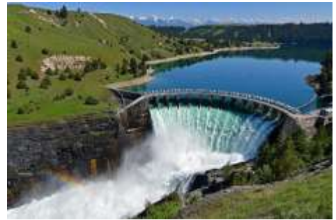
A few shots from our Dam Ride Submitted by: Chris