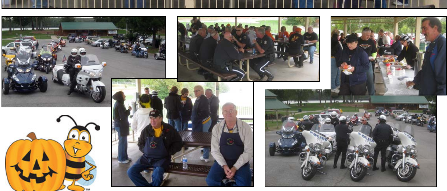
To TN Chapter B: I want to say "Thank You" for hosting the meal in Knoxville for the Wings Across TN ride. It was a great meal and I enjoyed it very much. The Goldwing group presented over $63,000 to St. Jude. I also want to say thanks for the support of Chapter B for St. Jude Hospital and also for the Ride for Kids. I