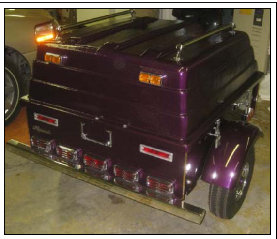
Trailer painter to color match Gl1500 Aspencade, custom cooler chrome cooler rack, chrome wheels and chrome trailer hitch and chrome parking arm, chrome rear bumper with extra lights. $500 Firm price!