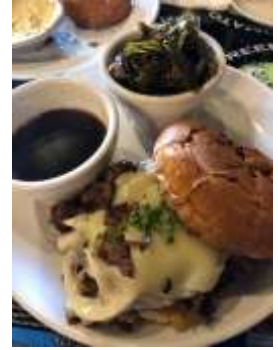
Article submitted by Stanley

We pulled back out and got back on 63E which is a very nice route headed toward Sneedville, this road has some really nice curves on it and takes you right along a ridge through the country and a few farms. One of the great advantages of some of these back roads is very little traffic and loads of scenery. At one point before getting to Sneedville you have to cross over the ridge, it has some real tight switchbacks as you go up and over the ridge and when you get to the top and start over the