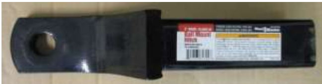
Haul Master Ball Mount Hitch, 2" drop, class III, almost new, MSRP $16, asking $10.