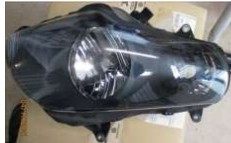
Honda 2012 Gold Wing headlight assemblies, left & right, asking $200 for both.