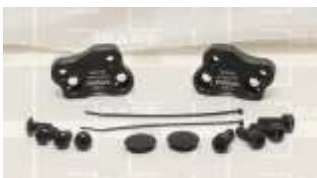
HeliBars Tour Performance handlebar risers for 2018+ Honda GL1800. Very-good condition, only used a short time (replaced with the Helibars Handlebar system), MSRP $129.00, asking $75/OBO

I have a set of centramatic balancers for a 2010 two wheeler asking $225. Brand new. See Scott Seal