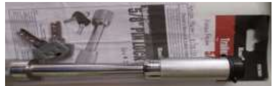
Haul Master Trailer Coupler, 5/8" pin loc, almost new, MSRP $11, asking $5.