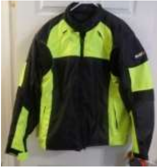
Bilt Spirit H2O jacket, lady's size large, brand new, MSRP $299.99, asking $50.